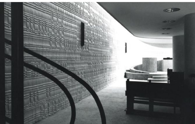
Facing page: Pala Rossa . 2005. Terra sigillata. 65 cm/h.