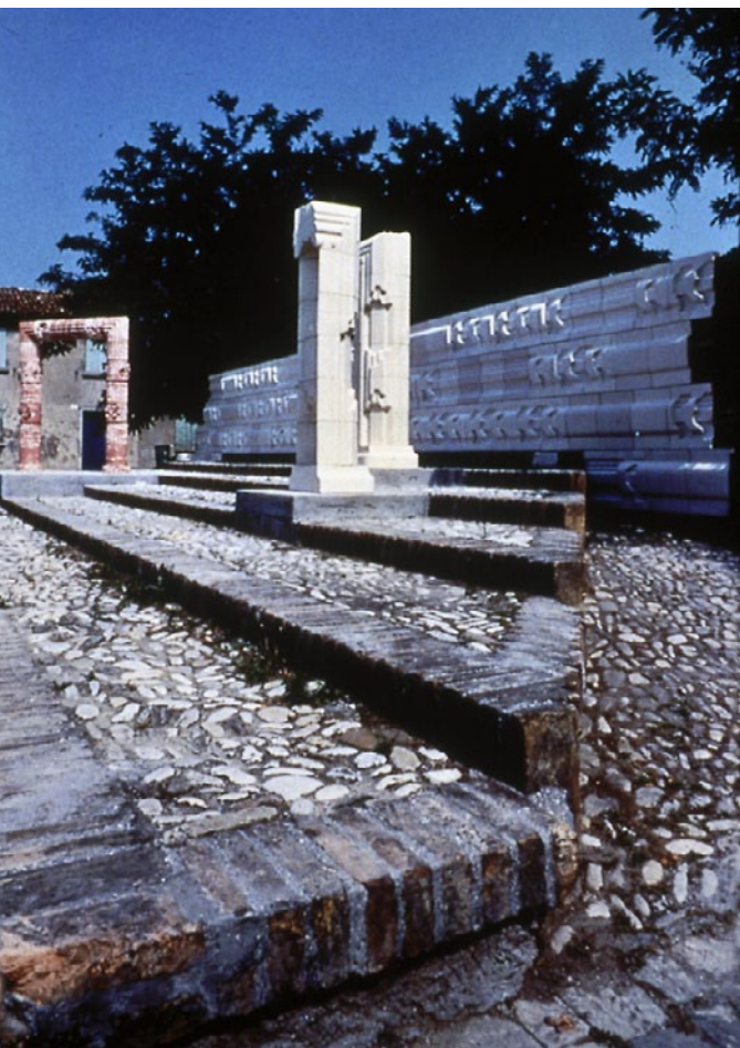
Below right: Wall sculpture . 1972. High fire ceramic. 129 x 1500 x 30 cm. Clayarch Gimhae Museum.